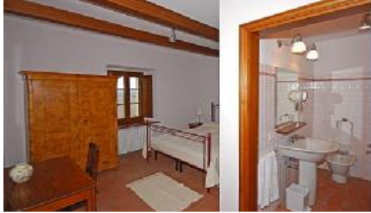
La Grance bedroom & ensuite