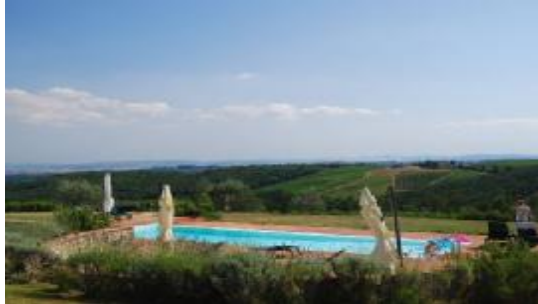
Pool and outlook

For more information or bookings, please contact: