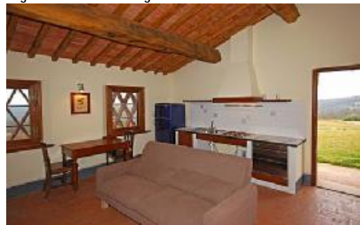
Borgonero Living Area