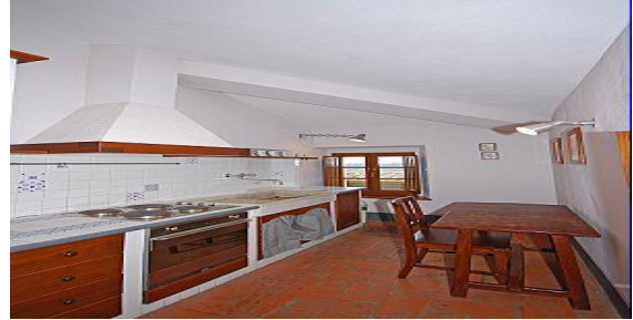
Ca delle Pazzo Kitchen