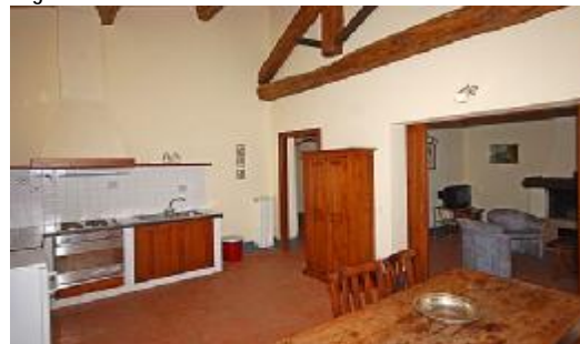
Doge delle Clavule Living Area