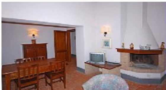
Ca delle Pazzo Living Area