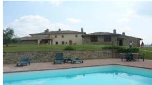
Farmhouse centre Barn on right

Ground floor: Spacious living room with fireplace, SAT TV and dining area, kitchen that opens onto living room (stove/oven, fridge, dishwasher, washing machine), small store-room, 2 double bedrooms one with ensuite. 1 twin bedroom. Another bathroom with bath.