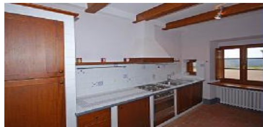
La Grance kitchen