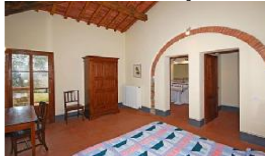
Doge delle Clavule Bedroom & Ensuite